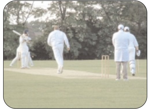
Annual Cricket Match

On Thursday 16 June the Chairman's Charity Golf Day at Hatfield London Country Club raised awareness and over £1,000 for the Chairman's Charities - Keech Cottage Children's Hospice and Women's Refuge.