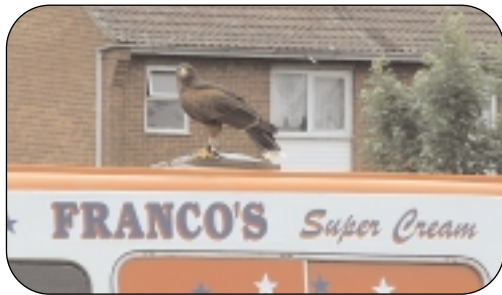
It appeared that Cassie one of the birds of prey was quite partial to an ice cream

Around 2,000 people enjoyed the attractions that included the Wembley and Watford Eclipse majorette troupe, Hertfordshire Spinnerettes and two Birds of Prey displays from Impact Falconry.